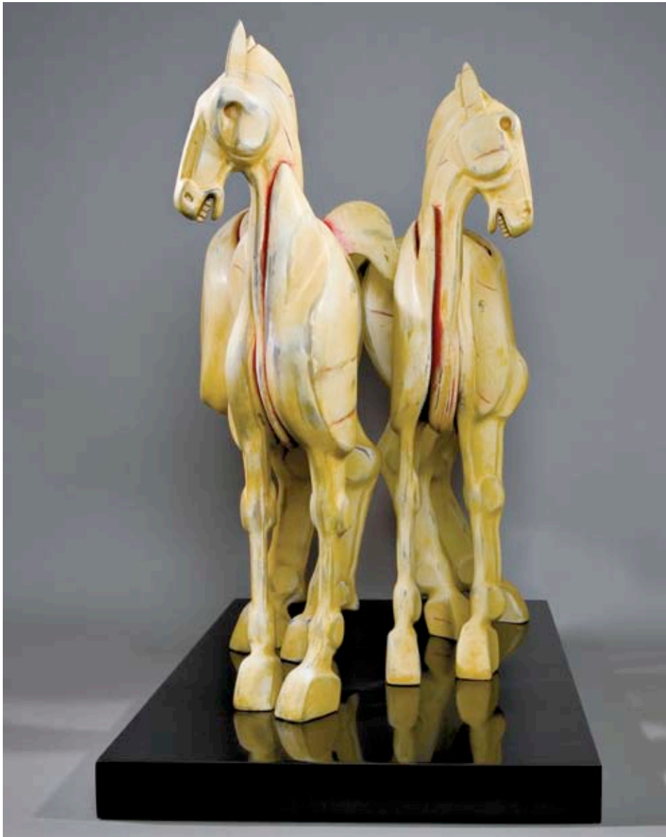
The patina is built from sanding the cardboard and then finishing it using the unique urethane process.