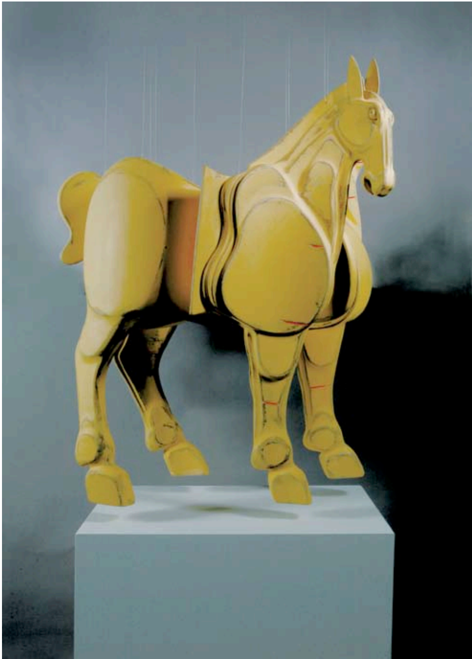
"Because a horse has four legs, I take its leg movement as an inspiration. When a horse moves, it is shifting its weight from one side of its body to the other. This simple act of walking changes the horse's entire anatomy."