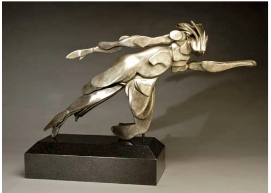
A chemical patina like silver nitrate has been used here to add a metallic finish to the sculpture.