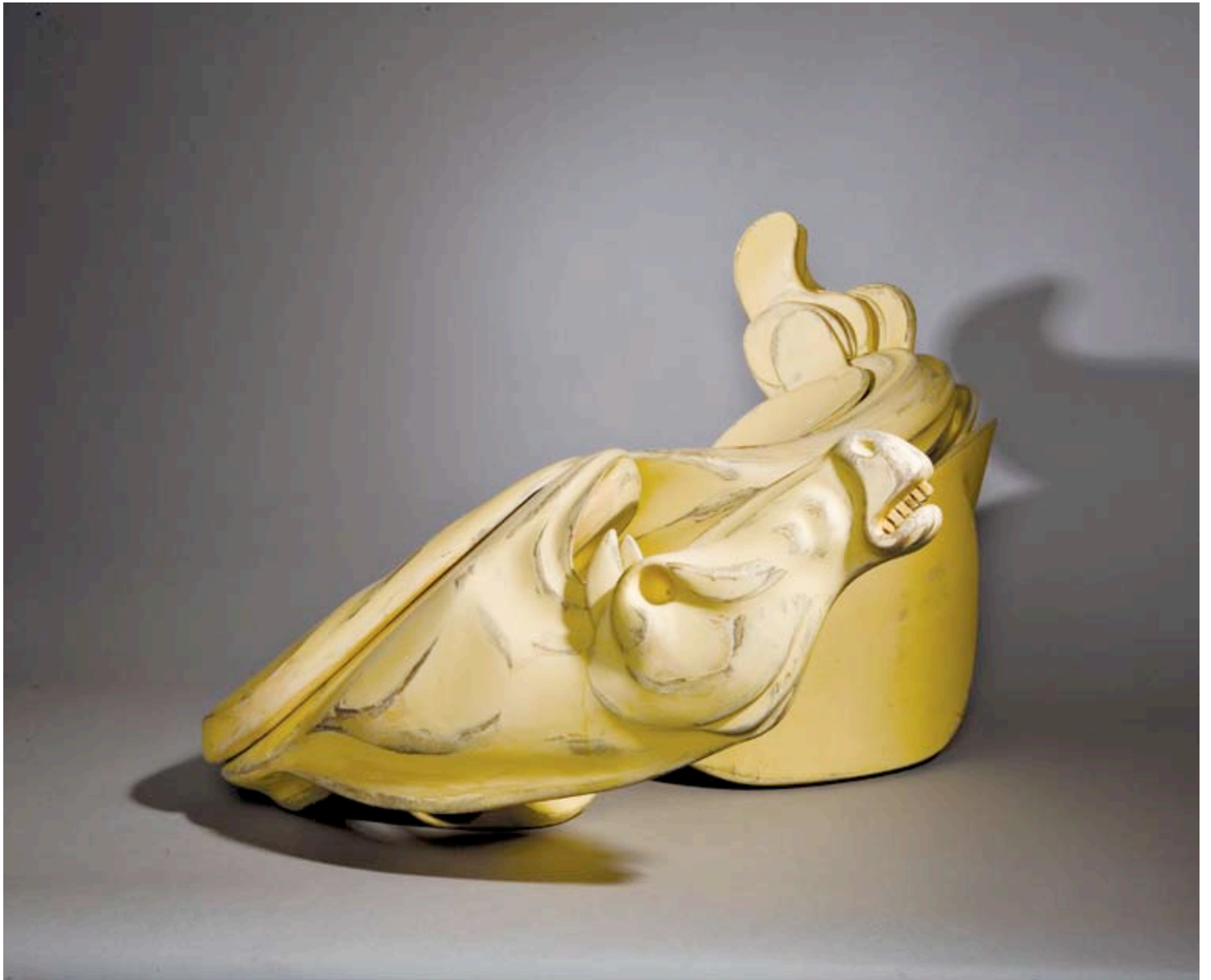
The Horse series is a representation of that perfect symphony between different elements of nature.